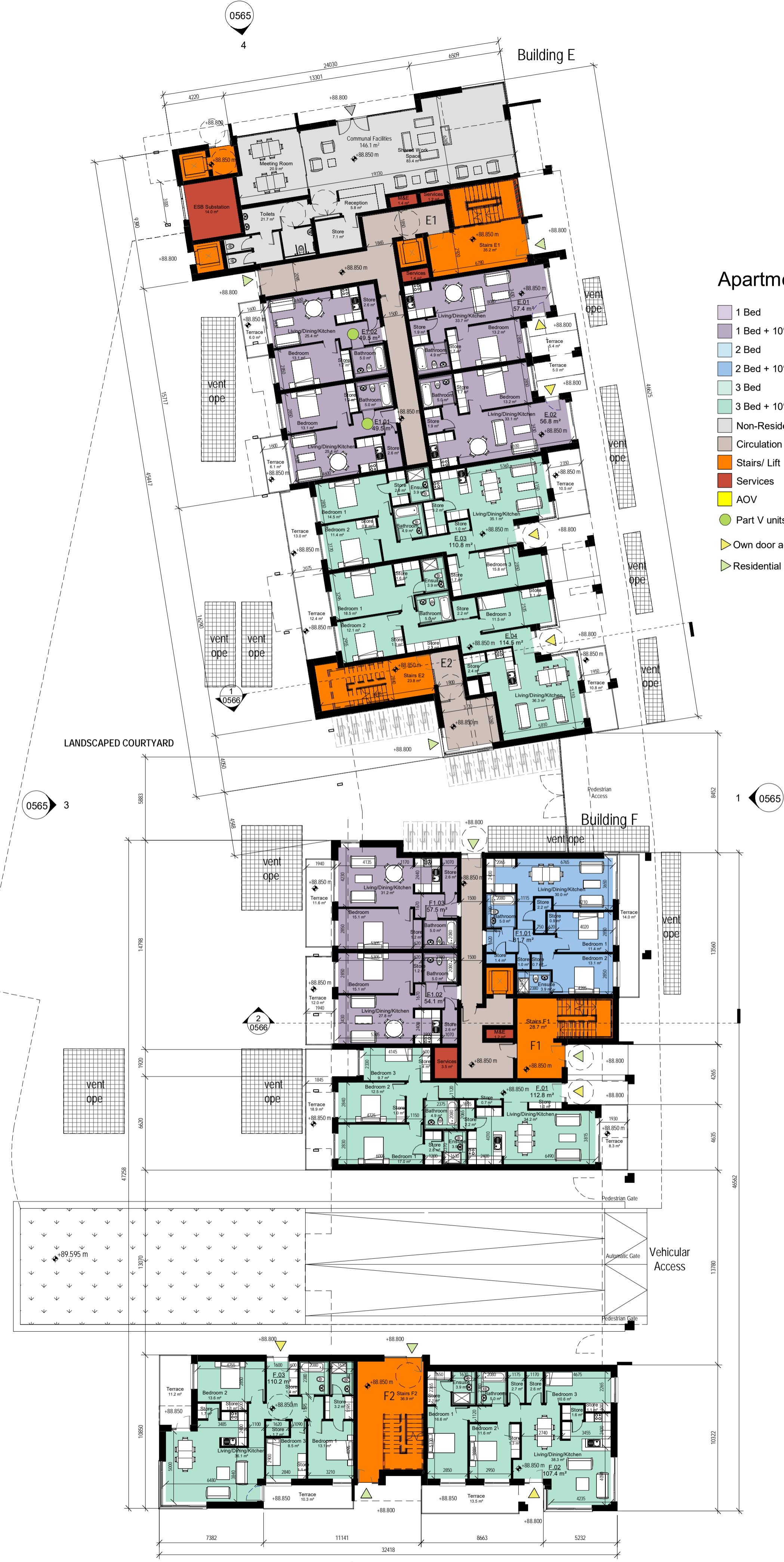
Proposed Ground Floor Plan 1:200

GENERAL NOTES: ALL DIMENSIONS ARE TO BE CONFIRMED ON SITE DIMENSIONS ARE NOT TO BE SCALED FROM THIS DRAWING THIS DRAWING IS TO BE READ IN CONJUNCTION WITH CONSULTANTS DRAWINGS ALL WORK TO BE CARRIED OUT IN ACCORDANCE WITH CURRENT BUILDING REGULATIONS